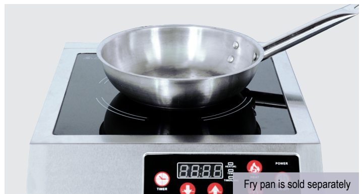
Fry pan is sold separately